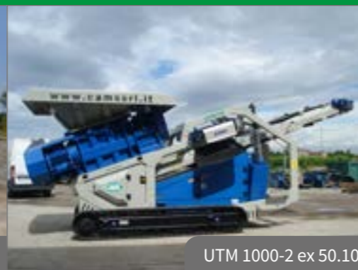
UTM 1000-2 ex 50.10