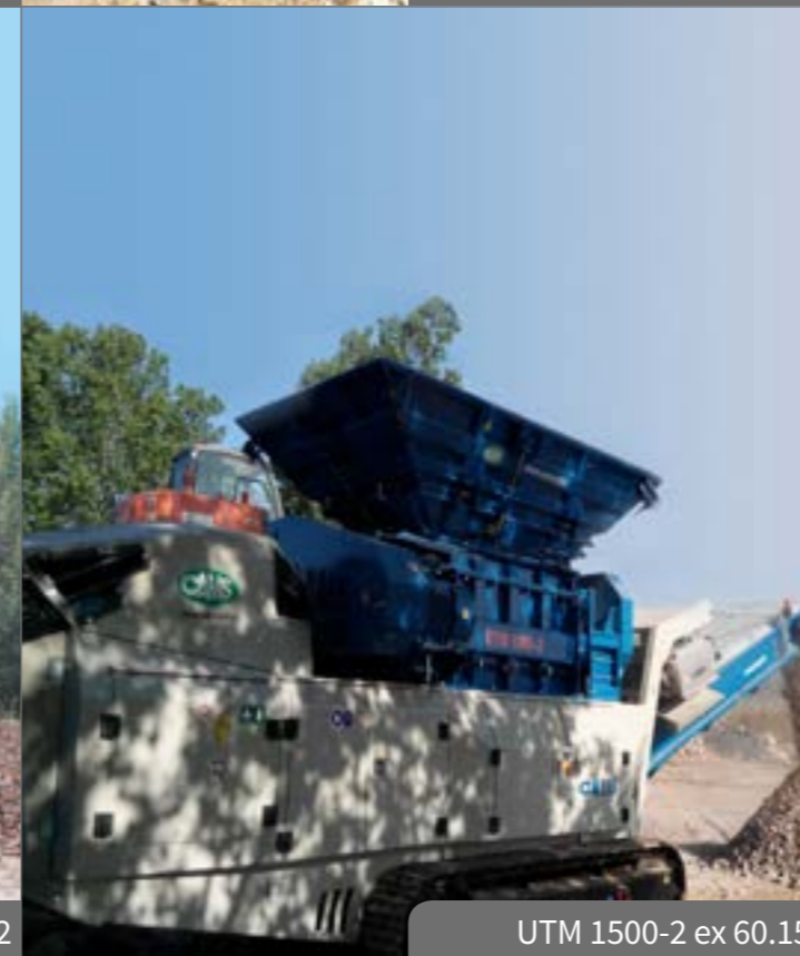
UTM 1500-2 ex 60.15