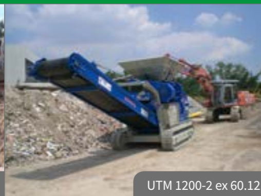
UTM 1200-2 ex 60.12