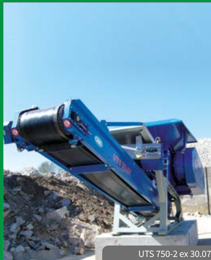
UTS 750-2 ex 30.07