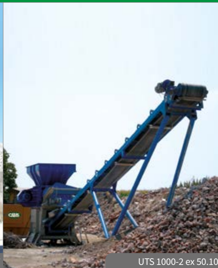
UTS 1000-2 ex 50.10