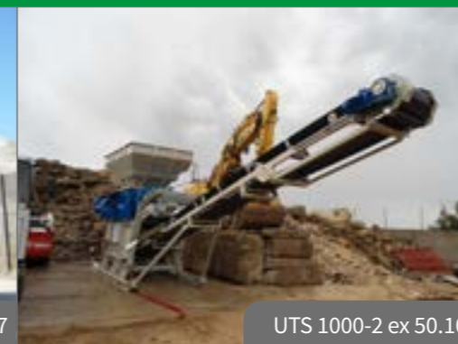
UTS 1000-2 ex 50.10