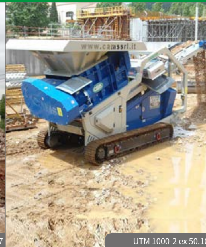
UTM 1000-2 ex 50.10