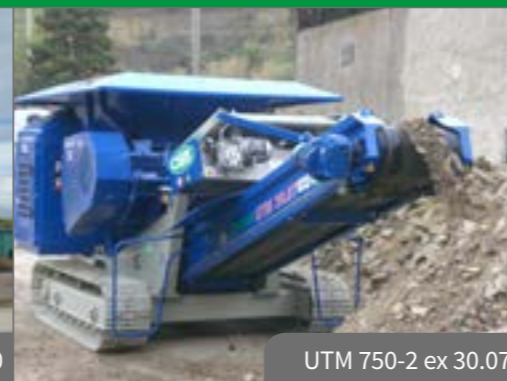
UTM 750-2 ex 30.07