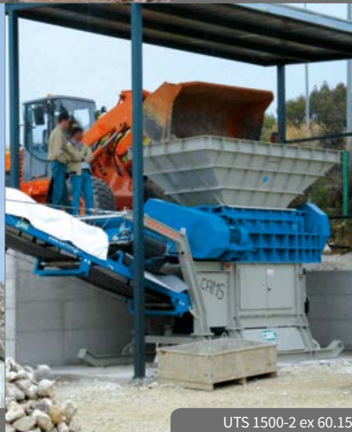
UTS 1500-2 ex 60.15