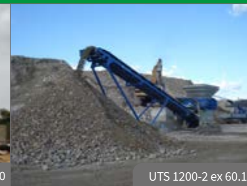
UTS 1200-2 ex 60.12