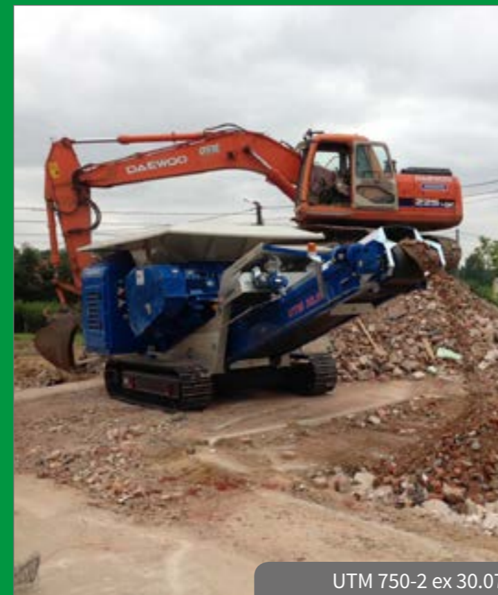
UTM 750-2 ex 30.07