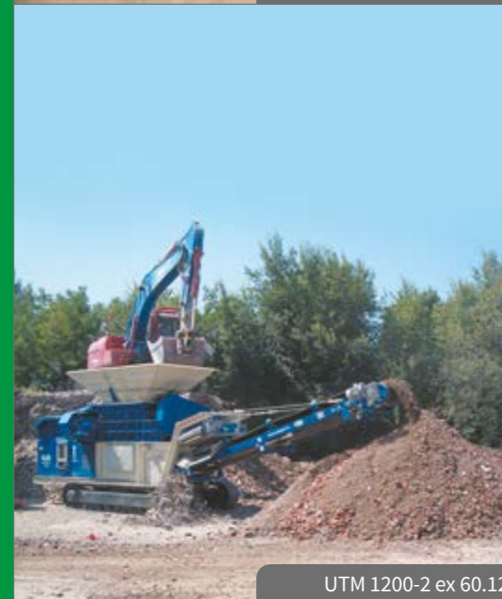
UTM 1200-2 ex 60.12