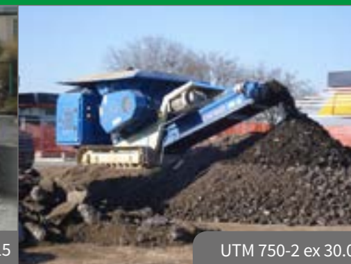
UTM 750-2 ex 30.09