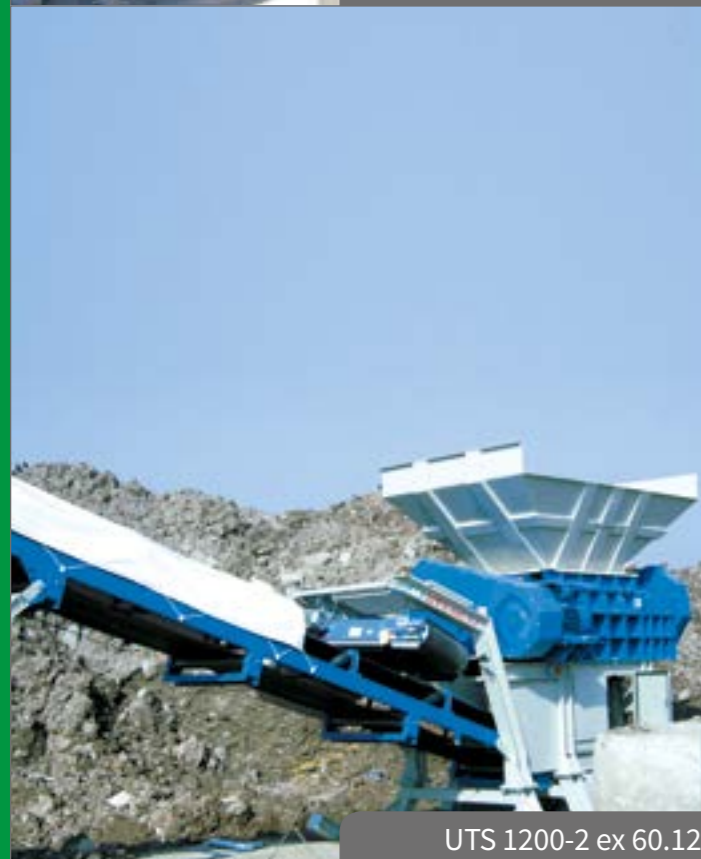
UTS 1200-2 ex 60.12