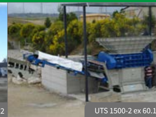
UTS 1500-2 ex 60.15