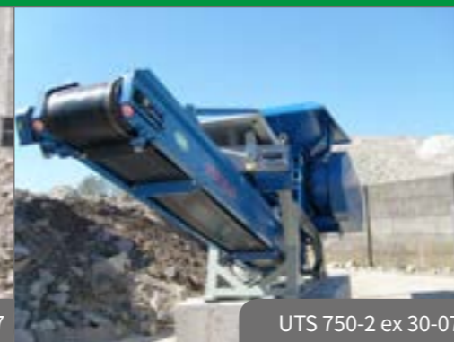
UTS 750-2 ex 30-07